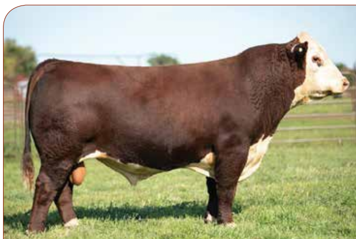
TH Frontier 174E - Reference Sire

EPDs CE: 1.0 BW: 4.0 WW: 70.7 YW: 123.2 M: 27.2 TM: 62.6