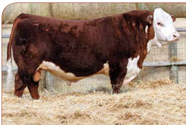
NJW 73S W18 Homegrown 8Y ET - Reference Sire