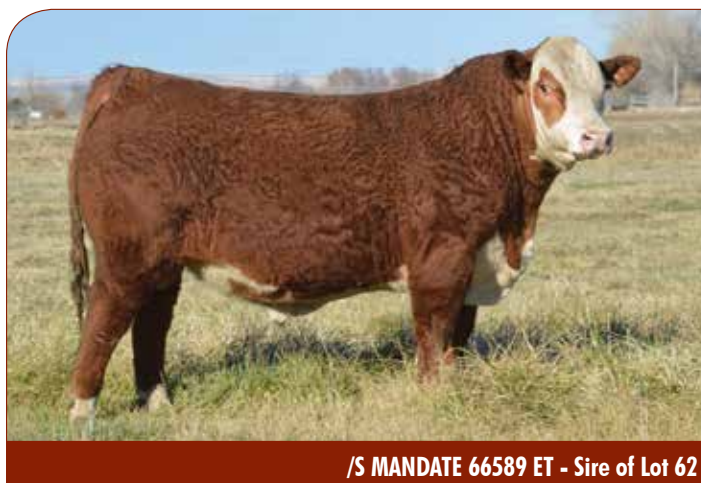
/S MANDATE 66589 ET - Sire of Lot 62