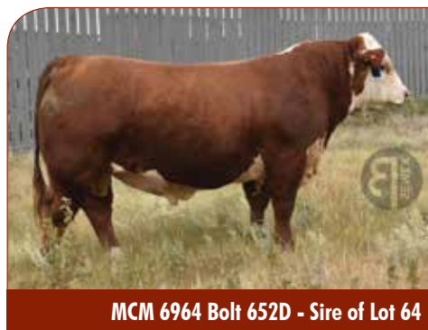
MCM 6964 Bolt 652D - Sire of Lot 64