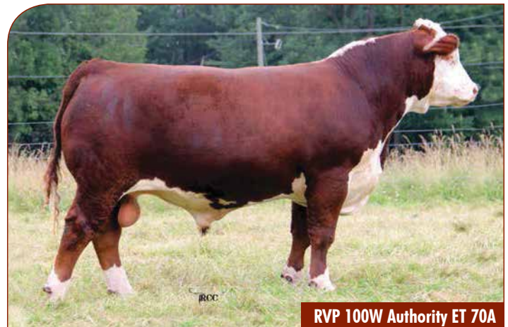
RVP 100W Authority ET 70A