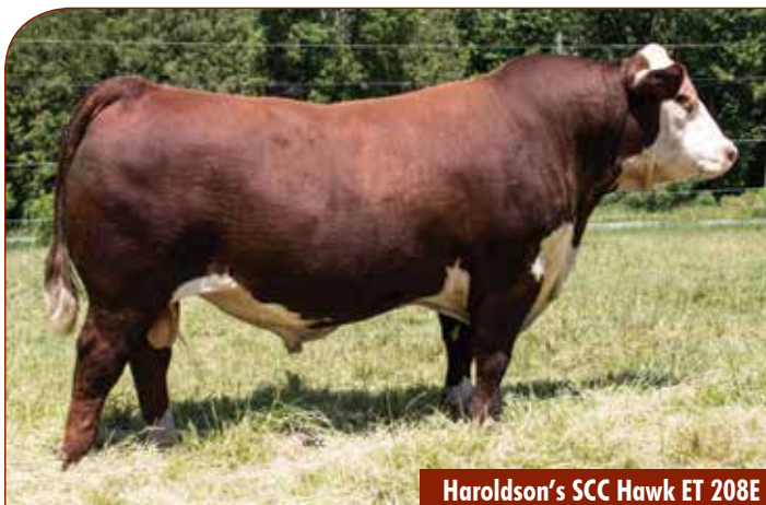
Haroldson's SCC Hawk ET 208E