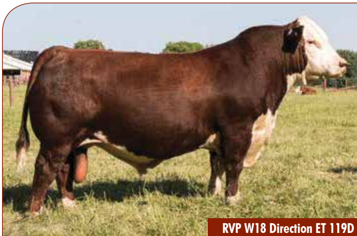
RVP W18 Direction ET 119D