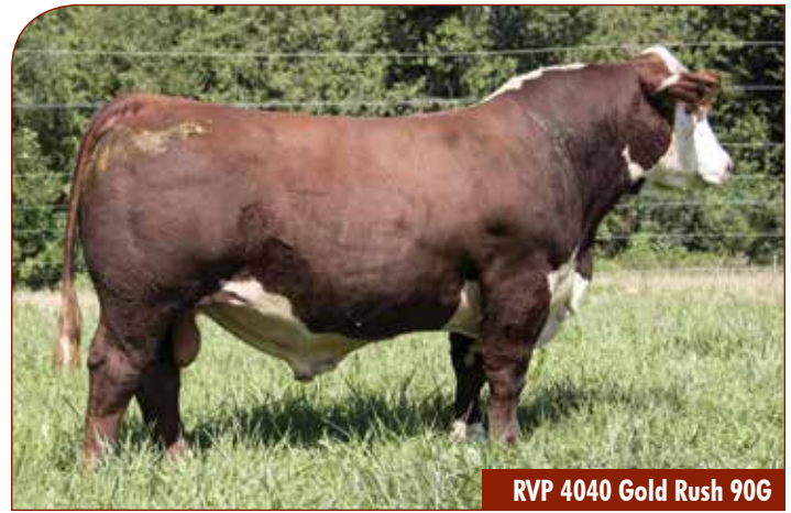
RVP 4040 Gold Rush 90G