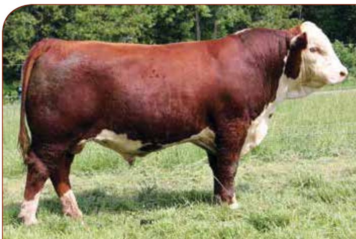
RVP 14Z Branson 65B - Reference Sire

EPDs CE: 8.2 BW: 1.1 WW: 51.6 YW: 85.2 M: 17.4 TM: 43.2