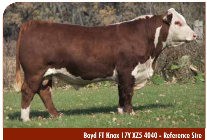
Boyd FT Knox 17Y XZ5 4040 - Reference Sire