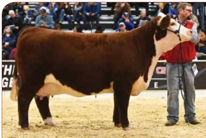
RVP 106A Cameo Girl 45C - Maternal Sister to Lot 12