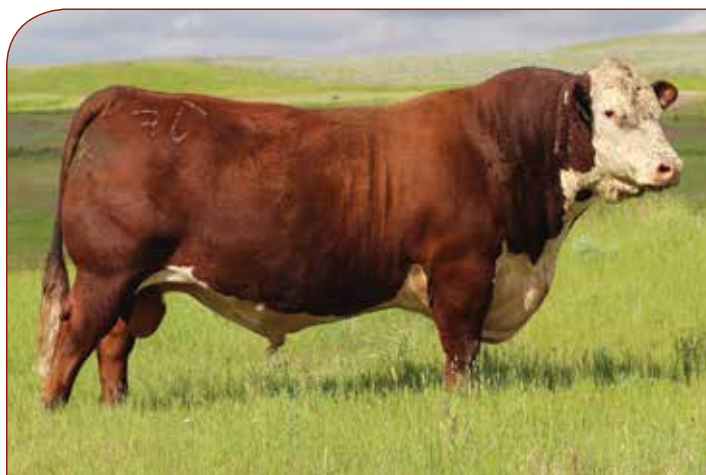
NJW 76S 27A Long Range 203D ET - Reference Sire