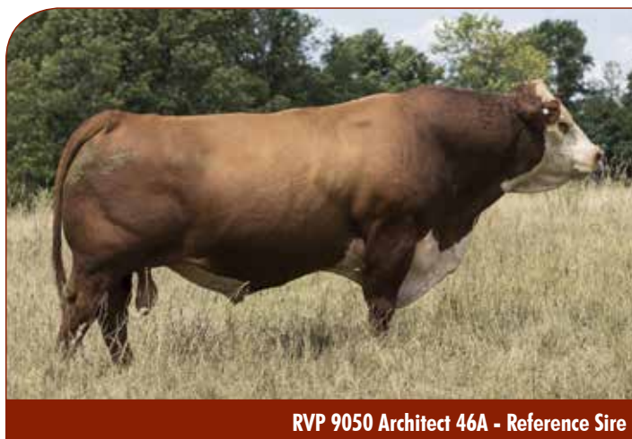
RVP 9050 Architect 46A - Reference Sire