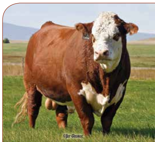
NJW 73S M326 Trust 100W ET - Reference Sire