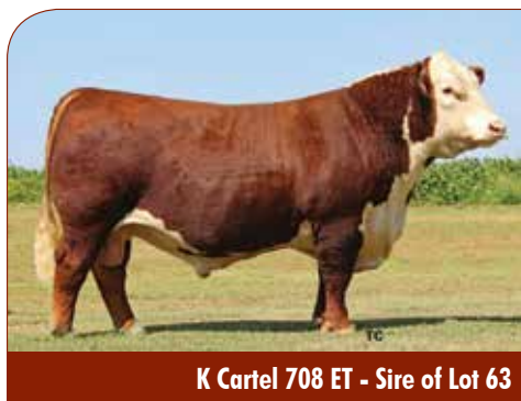
K Cartel 708 ET - Sire of Lot 63