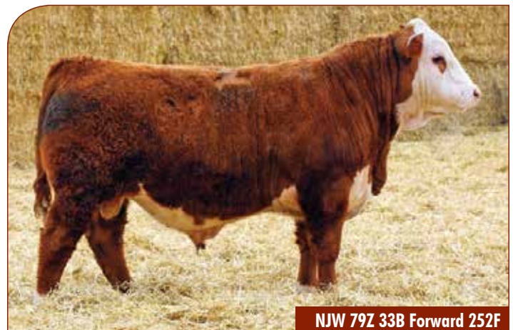
NJW 79Z 33B Forward 252F