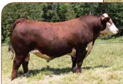
Haroldson's SCC Hawk ET 208E - Sire of Lot 23A