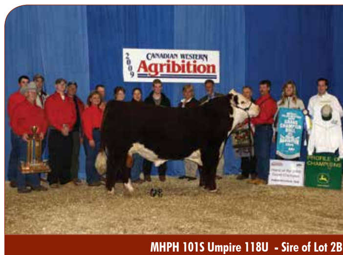
MHPH 101S Umpire 118U - Sire of Lot 2B