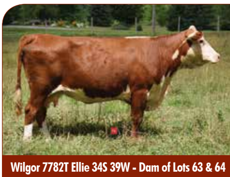
Wilgor 7782T Ellie 34S 39W - Dam of Lots 63 & 64