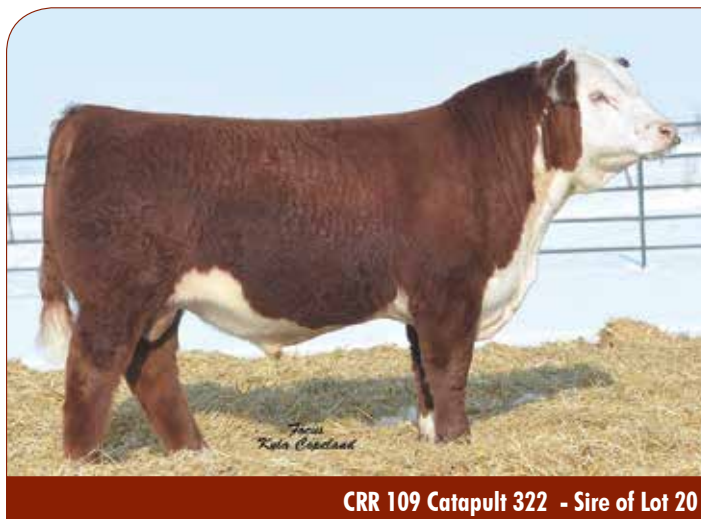
CRR 109 Catapult 322 - Sire of Lot 20

EPDs CE: 2.5 BW: 1.8 WW: 57.6 YW: 89.6 M: 29.2 TM: 58.0